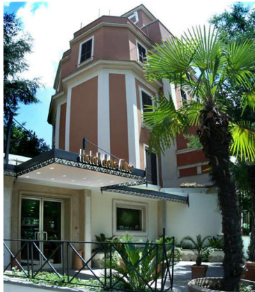
Hotel delle Muse ***

The Alexandra Hotel is a cozy and luxurious family run establishment, which is located in the heart of Rome on the renowned Via Veneto, whom many will remember as the backdrop for Federico Fellini's most famous movie La Dolce Vita. The property is therefore minutes away from some of the spectacular sights of the Eternal City, such as the Spanish Steps, the Trevi fountain, Piazza Navona and the charming Villa Borghese park.