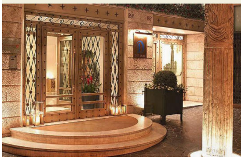
The Duke Hotel ****

The Duke Hotel lies in the heart of the splendid and highly exclusive area in the centre of Rome. Situated next to the park of Villa Borghese, Piazza del Poppolo, Spanish Steps. The Hotel is a quiet and private place to return after a day of exploring the city's many attractions or doing business.