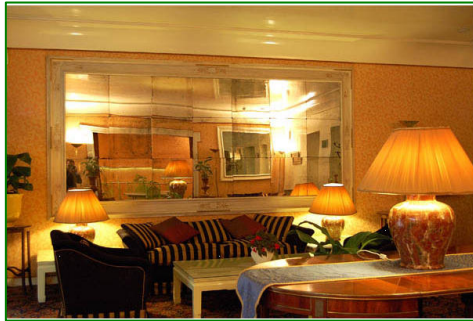
Hotel Panama Garden****

Hotel Panama Garden enjoys a peaceful location in Rome's most exclusive area, near Villa Ada Park and within easy reach of the historic centre . Surrounded by private gardens, it is the perfect place to escape after a busy day of sightseeing or business. This comfortable boutique hotel has a total of 47 guestrooms. All the rooms are in classic style, updated with modern design details and amenities including satellite television (with free Sky programs), air conditioning, free Wi-Fi internet connection.