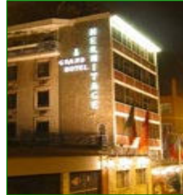
Hotel Leonardi/ Hermitage****

Hotel Torino is a beautiful four stars hotel set in an elegant building meticulously restored, close to the Santa Maria Maggiore Basilica, the Opera House and the ancient heart of the Eternal City. The Hotel Torino has 7 floors and a beautiful panoramic terrace, served by an elevator. The rich buffet breakfast is included in the rates.