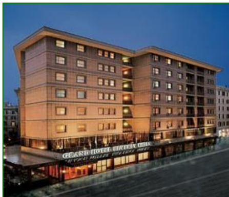
Grand Hotel Beverly Hills****

Close to Villa Borghese and Via Veneto, the hotel offers dignified and exclusive surroundings. The stylish restaurant of our hotel in Rome offers both regional and international cuisine.