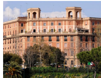
Hotel Astrid ***

Hotel delle Muse is located in the elegant, lushly-vegetated, quiet, residential area of Parioli. Recently-renovated, the hotel offers relaxing, comfortable accommodations within easy reach of the city center.