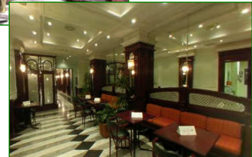
Hotel Regent **** - Ritz Hotel ****