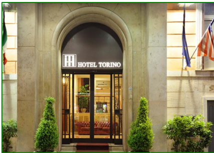
Hotel Leonardi/ Torino****

Hotel Torino is a beautiful four stars hotel set in an elegant building meticulously restored, close to the Santa Maria Maggiore Basilica, the Opera House and the ancient heart of the Eternal City. The Hotel Torino has 7 floors and a beautiful panoramic terrace, served by an elevator. The rich buffet breakfast is included in the rates.