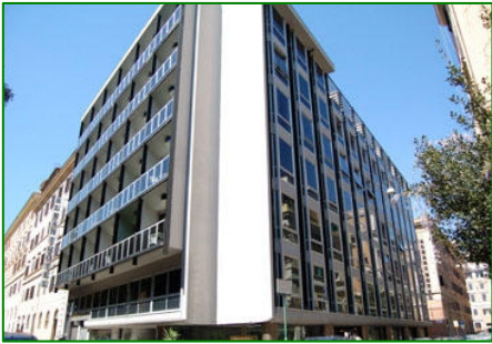
Hotel Albani ****

Hotel Albani Roma is in the midst of Parioli-Salario, a quiet and elegant residential area. It is perfect for a break after business and the location allows decent nights sleep away from all the noise in the historical center.