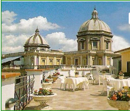
Hotel Leonardi/ Gallia****

Hotel Gallia is set in a nice building of the end of XIX century, situated in the historical center in front of Santa Maria Maggiore Basilica and very close to Coliseum and Fori Imperiali. Completely and elegantly renewed Hotel Gallia reopened in 1999. Offers a rich buffet breakfast served in a nice breakfast-room, a library Bar and a charming rooftop terrace.